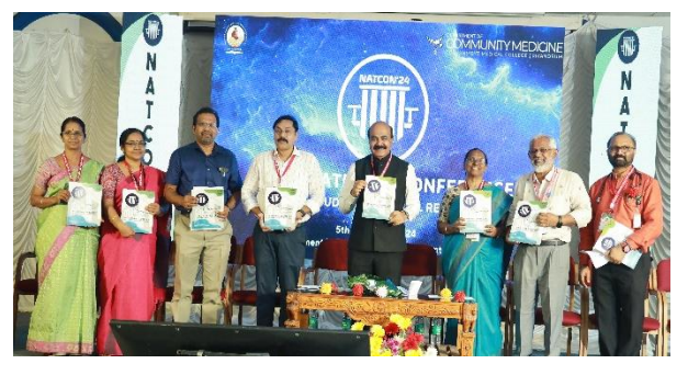
NATCON'24 Souvenir Book unveiling ceremony