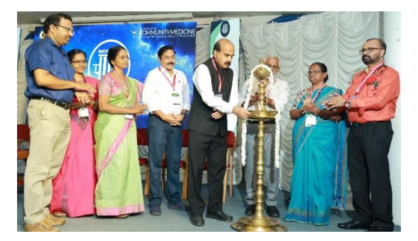
Lamp Lighting Ceremony